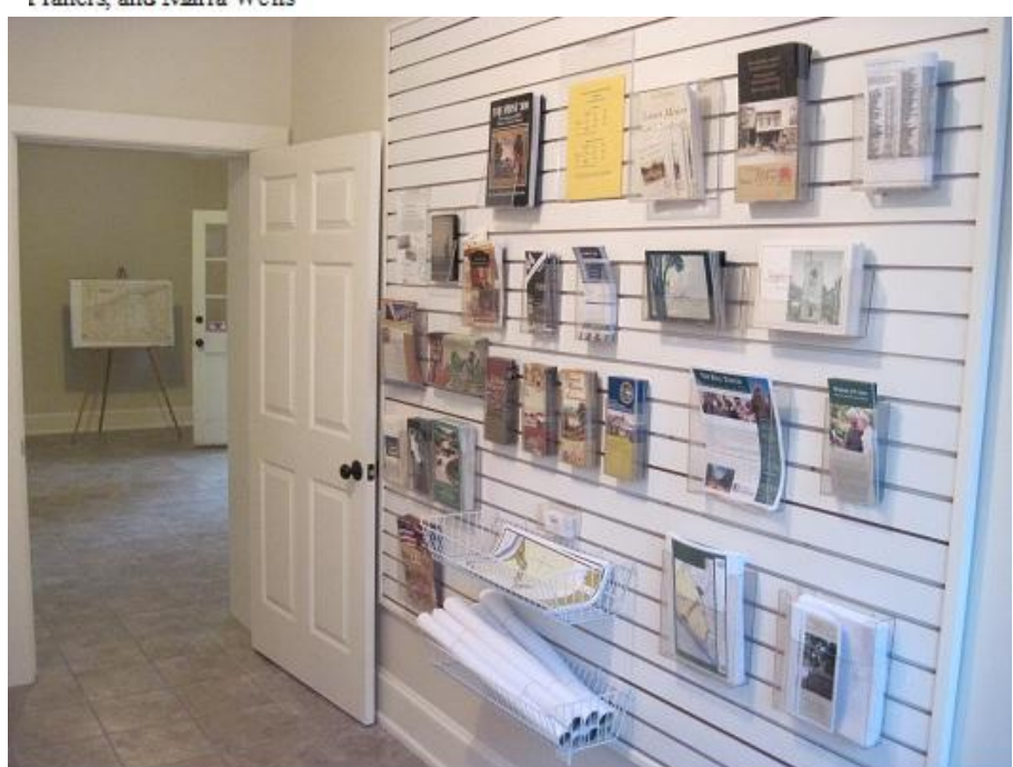
The Vestibule Area in the Station's Trailhead