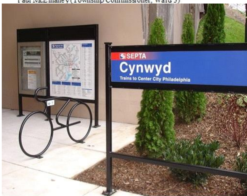
The New Cynwyd Train Station Platform