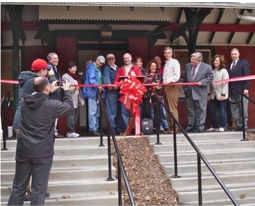
The Ribbon Cutting Ceremony