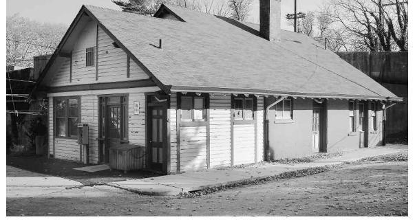
The Cynwyd Train Station as it looks today. View is of the west side facing Conshohocken State Road

Montgomery County Commissioners to purchase the 6.5 acre Spaventa switchback, which will extend the trail one-half a mile to the intersection of Belmont Avenue and Rock Hill Road. The Township is still negotiating with Westminster Cemetery to purchase approximately 9 acres for additional recreational space along the trail.