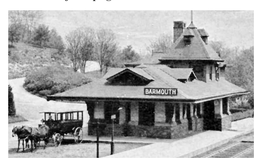
Early view of the Barmouth Train Station that was located along the Cynwyd Trail. It was abandoned and is now demolished.

Later this spring the Township will be soliciting proposals from landscape architects to work with the community to design the Cynwyd Trail. It is anticipated that the design process will wrap up sometime over the winter and that formal trail construction can begin by next spring.