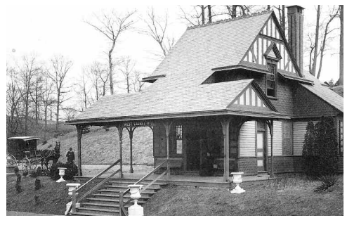
Early view of the West Laurel Hill Train Station that was located along the Cynwyd Trail. It was abandoned and is now demolished.

Also, this spring SEPTA has indicated that they will be removing the remaining tracks and ties from Cynwyd Station to Barmouth Station. This will effectively make the trail walkable from the Cynwyd Station to the Manayunk Viaduct Bridge. There have even been positive conversations between Lower Merion and SEPTA about extending the trail over the Viaduct.